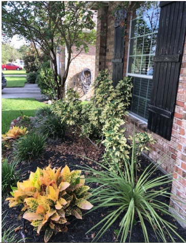
Landscaping to the left of the front door