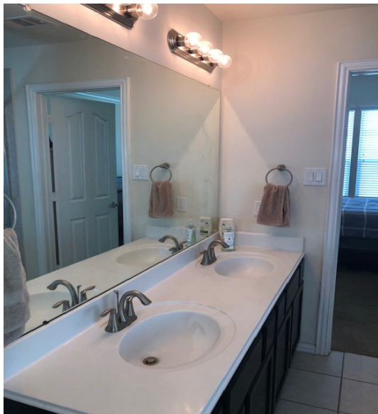
Dual sink vanity, Hollywood lights