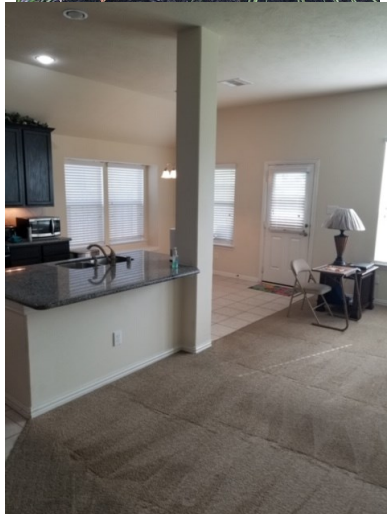
Open concept kitchen, breakfast room and family room