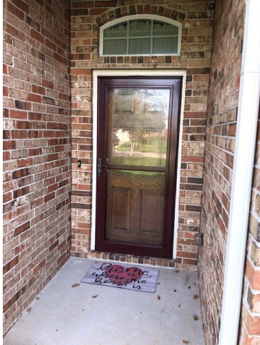
Front door with storm door, transom window and protection from the elements.