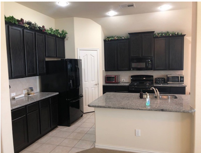
Kitchen, 43" cabinets, double sink in the island, microwave, disposal and tile floor.