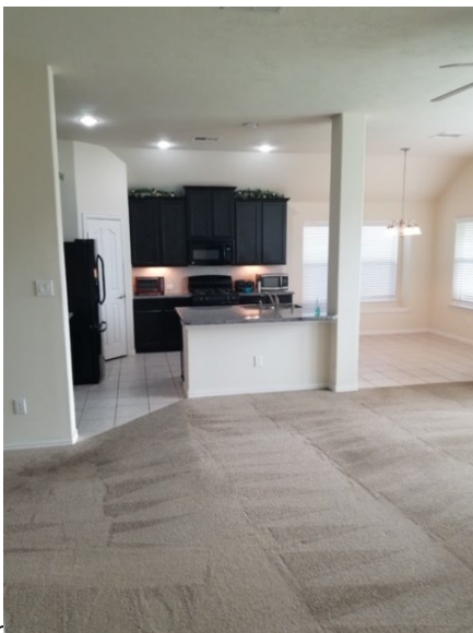
Family room to kitchen view