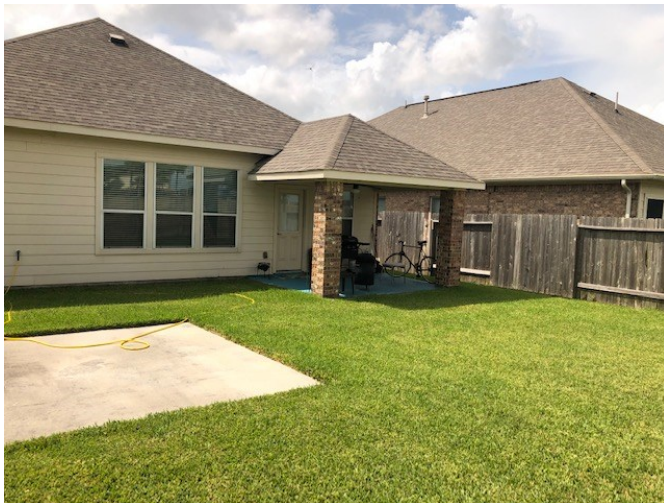
Back yard, covered patio and open patio